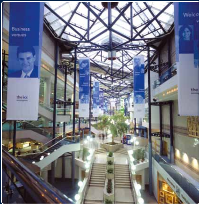
Interior of the ICC.