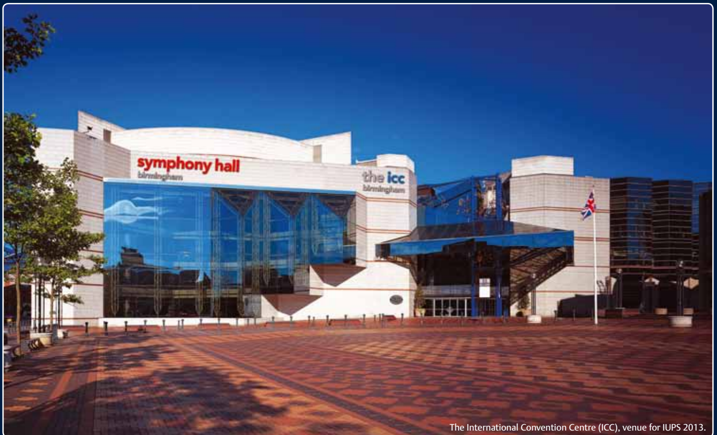
The International Convention Centre (ICC), venue for IUPS 2013.