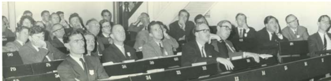
Audience at the Inaugural Meeting of the Australian Physiological Society, May 1960