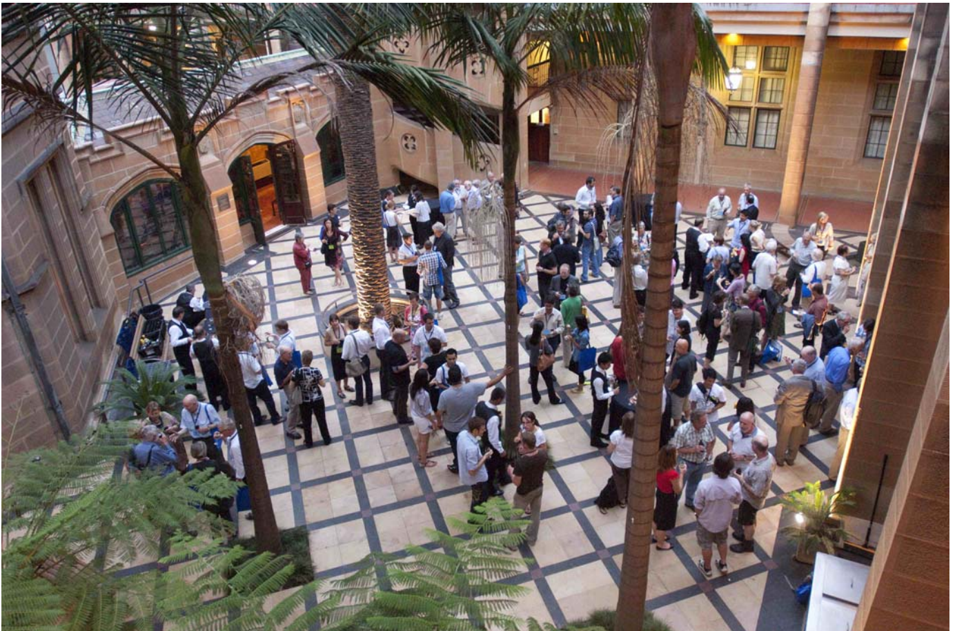
Cocktail party in the Anderson Stuart courtyard, following the historical seminar.