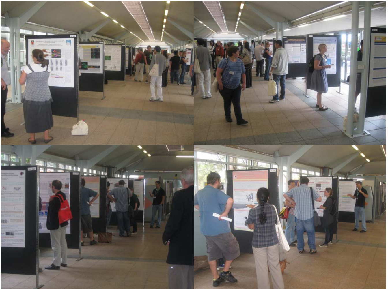
Busy poster sessions...