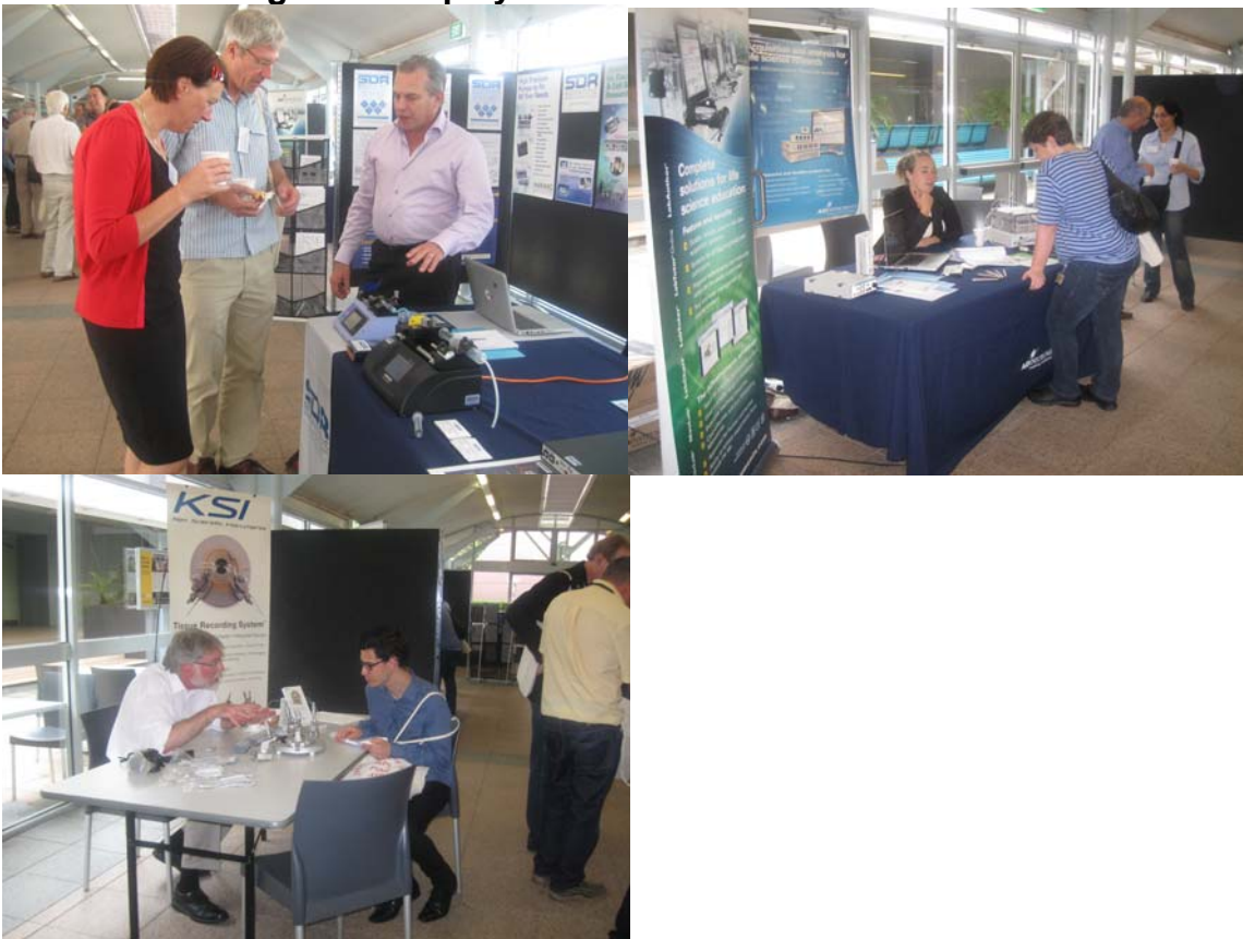
...and interesting trade displays